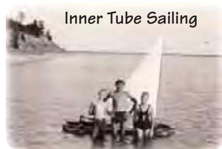
Inner Tube Sailing